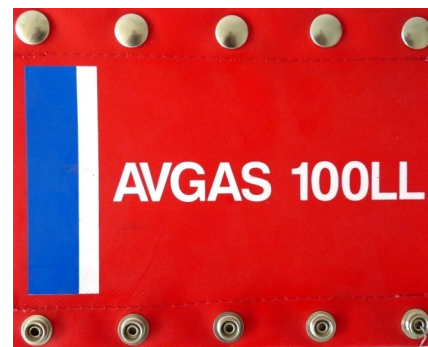
Hose cover, 1 inch AVGAS 100LL Part no. 5100000005