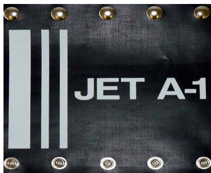
Hose cover, 1.1/2 inch JET A-1 Part no. 5100000010

It has been accepted for some years that improvements needed to be made in order to reduce the number of incidents involving refuelling light aircraft with the incorrect fuel grade. Selective filler points/nozzle spouts and wing marking stickers have been introduced along with a number other measures, but as an additional reminder for the operator we have developed our Grade Identification Sleeves. They are screen printed with the relevant fuel grade identification on coloured vinyl and are secured onto the refuelling hose immediately upstream of the trigger nozzle.